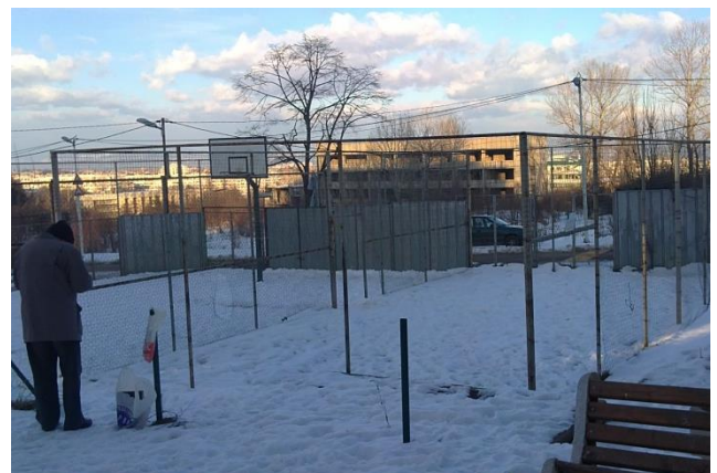
Recent pictures illustrating the current state of the outdoor space in the Ovcha Kupel refugee camp, Sofia, Bulgaria.